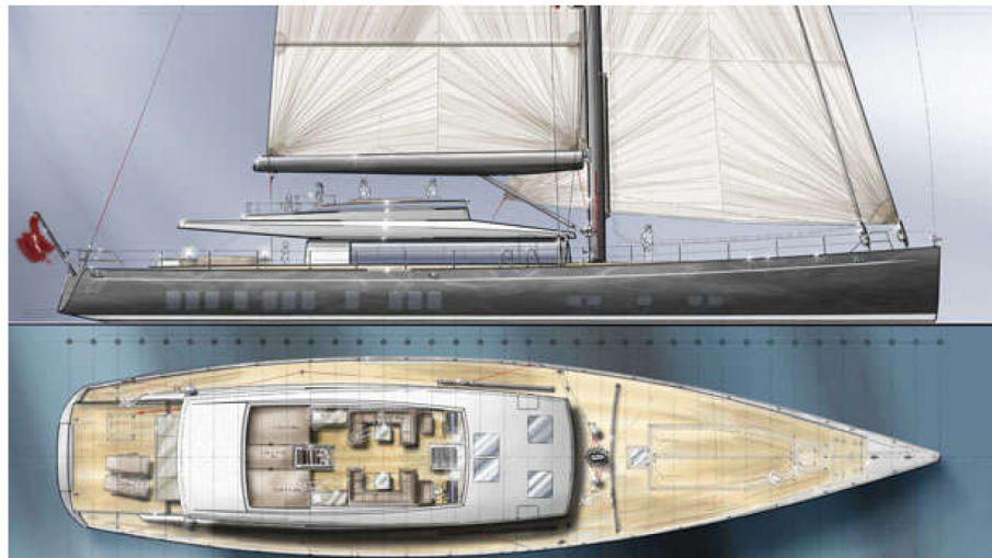
Rendering of the exterior profile Kingship flybridge sailing yacht

Barracuda Yacht Design has unveiled its new design for a Kingship 36.57 metre flybridge sailing yacht at the Monaco Yacht Show.