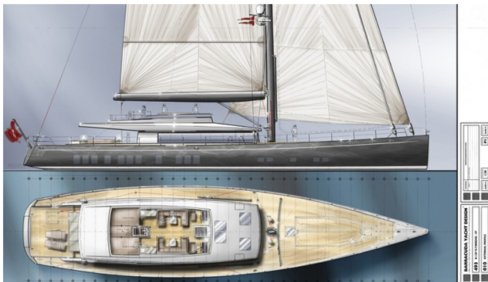
New 36,5m Super Yacht Design for Kingship by Barracuda Yacht Design

Barracuda Yacht Design revealed their new 36,5m (120') sailing yacht concept at last week's Monaco Yacht Show (MYS). The well known Asian shipyard, Kingship , requested the 36,5m Barracuda fly-bridge superyacht design for an experienced owner, searching for an orderly and 'un-pretentious' deck-house cruising yacht of high interior volume.